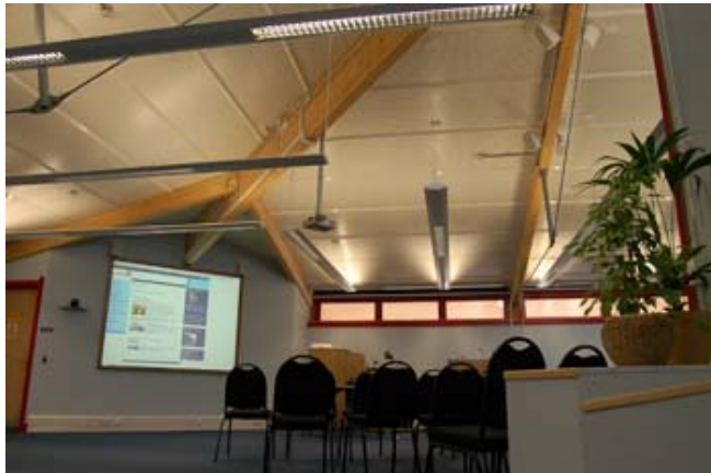
Inside the Centre

A plot of land was located on the Science Park Campus of Cambridge Regional College (CRC) and was selected for the UK SmartLIFE business and training centre. This site was chosen as it benefited from the existing facilities provided by CRC and was in a good central location. The College is a well-established further education college, with relatively new buildings (phase 1 opened in 1993). It has on-site amenities and facilities already in place which are typical of an establishment of this nature, for example classrooms, practical workshops, canteen, staff offices, reception/foyer area and car parking. The College is also part of the Centres of Vocational Excellence (CoVE). As SmartLIFE was looking to develop courses in MMC it was a perfect match to be situated on the same site as the further education college that already teaches construction. The high demand for places on the colleges existing construction course's means they were also looking to develop courses further and increase their capacity. The goal of the project was to train around 1,300 people over three years in modern, sustainable methods of house building. The site also benefits from good infrastructure, with effective road, rail and bus networks.