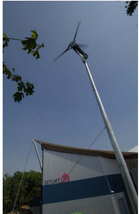
Wind turbine powering the centre